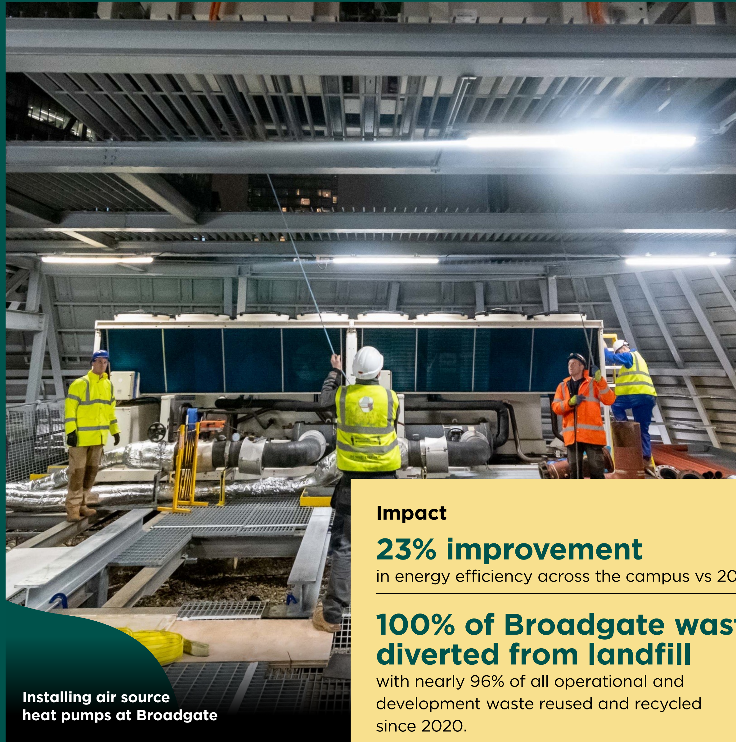
Installing air source heat pumps at Broadgate